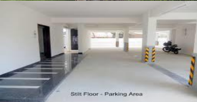
Still Floor - Parking Area